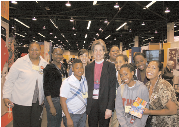
Eleven young African Americans visit the General Convention under the auspices of the Office of Black Ministries.

As a Provisional Delegate to Convention from the Diocese of Massachusetts, I was able to observe events from a unique perspective. My committee “assignment” was to attend hearings of the Ministry committee, whose agenda was somewhat “light” compared to the other Standing Committees. It also allowed me to be present for the House of Bishop’s debate and vote on Resolution D-025, in a packed gallery from which text messages were flying back and forth to the floor of the House of Deputies. The non-anxious presence of the Presiding Bishop, her candor, grace and dry sense of humor, coupled with the unmistakable presence of the Holy Spirit in that