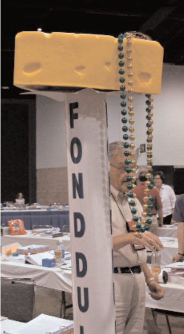
The deputation of Diocese of Fond du Lac, located in northeastern Wisconsin, adorned its standard with a cheese head and festive beads.

updated and the following day's schedule planned.